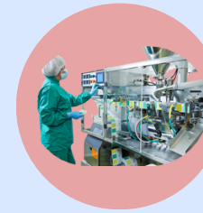
Pharmaceutical and Food Industry