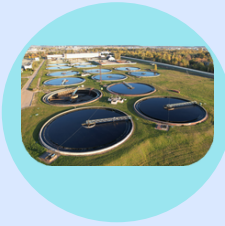
Sanitation and Water