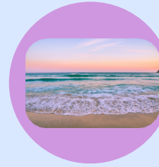
Natural and Recreational Waters