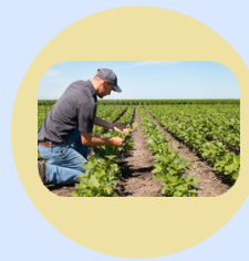
Agriculture & Livestock